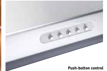
Push-button control C600M and C270 models