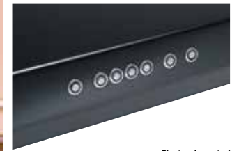
Electronic control C600E and C370 models