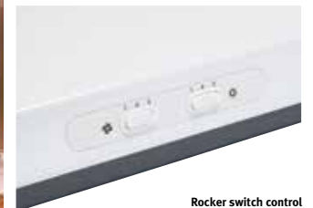
Rocker switch control C180 model