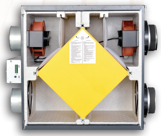
* ERV core color may differ from the HRV