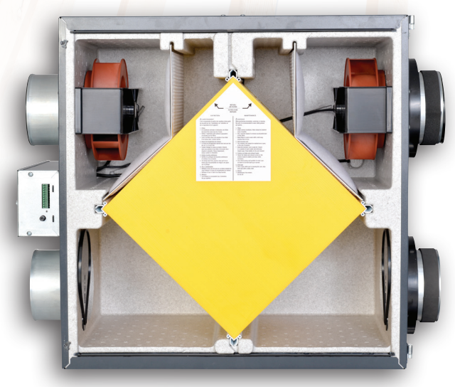
* ERV core color may differ from the HRV