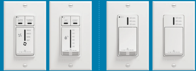
Automatic Control 41404