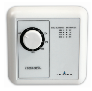
Part no. 11136